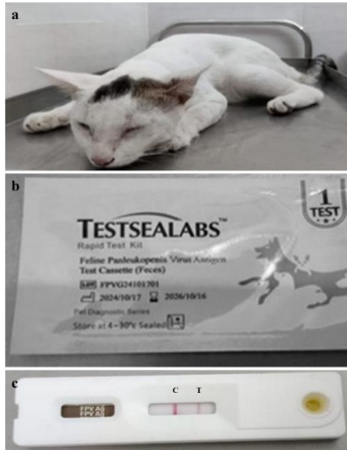
Figure 1. Figure showing a) typical sign of feline panleukopenia-infected cat. b) Rapid kit test of feline panleukopenia virus antigen. c) Feline panleukopenia positive reaction (C, control & T, test) in the rapid kit test.