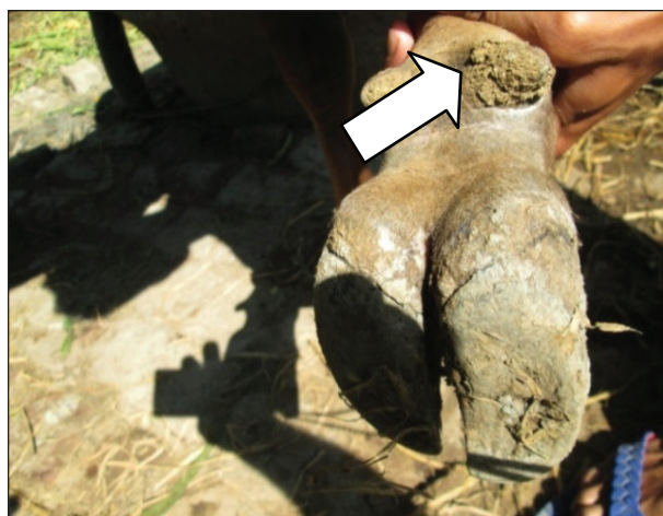
Figure 4. Claw overgrowth (White arrow)

to animals expressing normal behavior which was previously recognized by Nguhiu-Mwangi et al. (2013). Disposal of waste materials on the farm premises aids the propagation of various insects such as flies and mosquitoes. Although only about a third (31%) of the commercial units reared multiple species (sheep, goat, and so on) together which can create negative social interactions. Such interactions may in particular disrupt feeding by the more subordinate cattle.