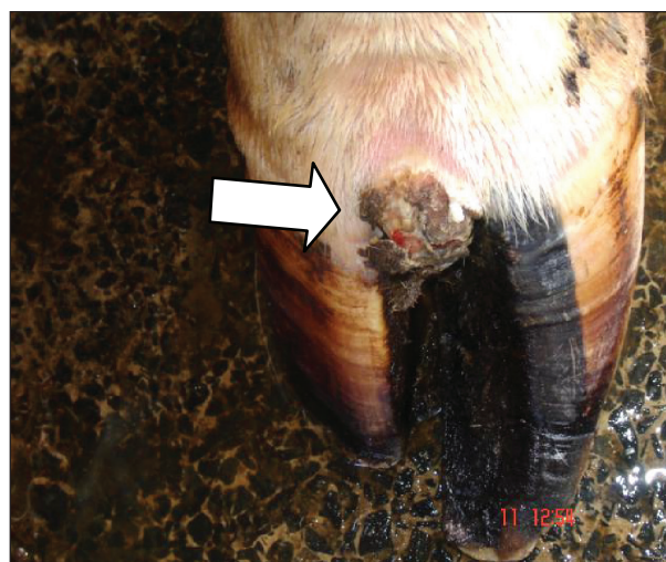
Figure 3. Hoof abnormality (Interdigital growth at the white arrow)

higher than for clean floors (7.4%). Hoof disorders were significantly minimized with the provision of rubber pads and floor cleanliness ( P < 0.05 ).