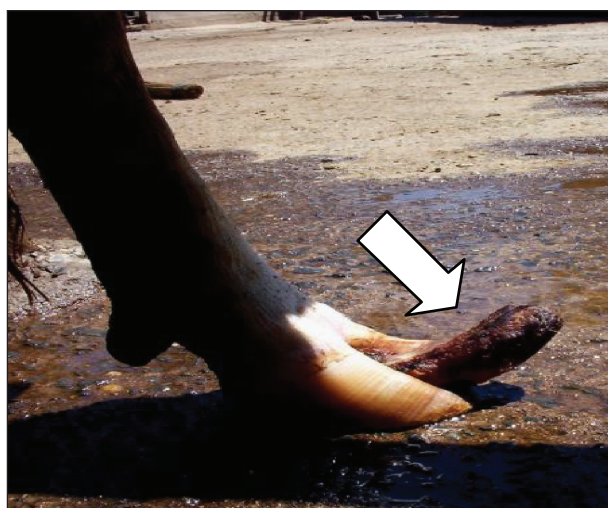
Figure 2. Hoof abnormality (Hoof overgrowth at the white arrow)