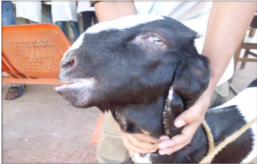
Figure 1. Swollen mandible and maxilla of the FOD affected goat

5 ml sterile syringe and transferred to sterile tubes without EDTA before sending to the laboratory of the Department of Physiology, Biochemistry and Pharmacology, CVASU. Blood was allowed to clot and serum was harvested after retraction of clot and stored in -20°C. Fibrous Osteo-dystrophy was primarily diagnosed by observing clinical signs of mandibular and maxillary enlargement, pain on pressure at the enlarged bone, protruded tongue and dyspnea which was then confirmed by elevated level of phosphorus on serum evaluation.