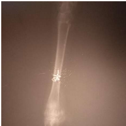
Figure 3. Radiographs showing satisfactory alignment and healing progress on day 30 post-operation.