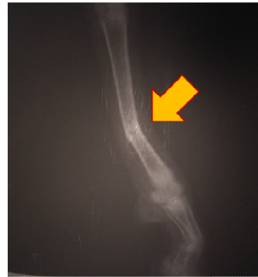
Figure 1. Preoperative radiograph in sheep showing oblique metatarsal fracture of the left hind limb

the suture line, and after rolling the broken area in gauze, splints (made of bamboo sticks and coated in cotton) were put around it.