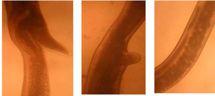
Photograph 1. Linguiform (left), Knobbed (middle) and Smooth (right) type of vulvar flap of Haemonchus contortus with light microscope (10X)